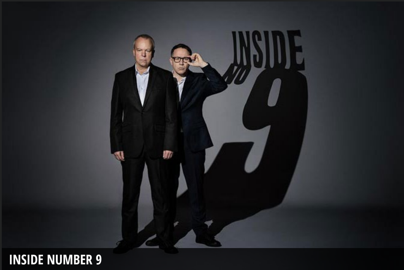
INSIDE NUMBER 9