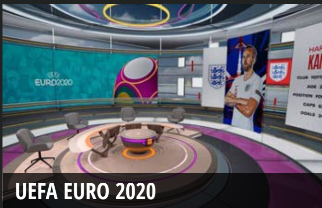
UEFA EURO 2020