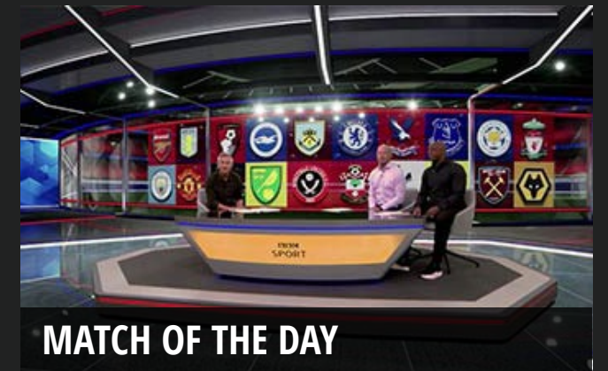
MATCH OF THE DAY