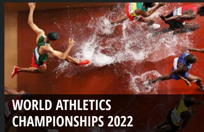
WORLD ATHLETICS CHAMPIONSHIPS 2022