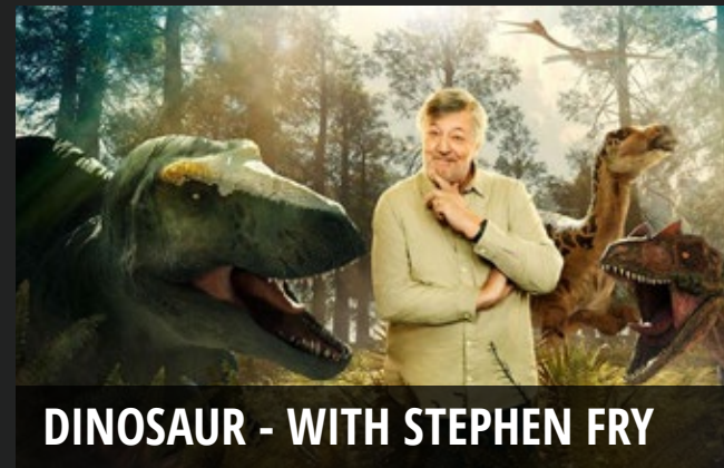
DINOSAUR - WITH STEPHEN FRY